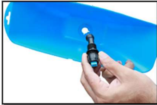
Step 1: Insert the nozzle from the inside.