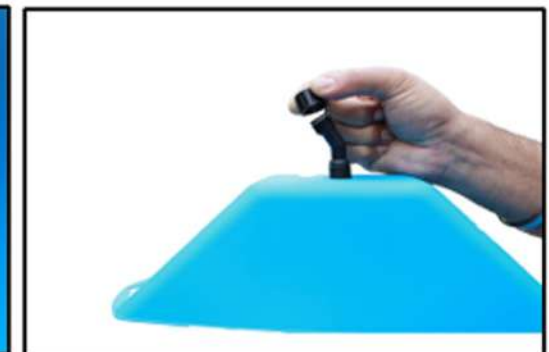
Step 3 : Insert the nut.