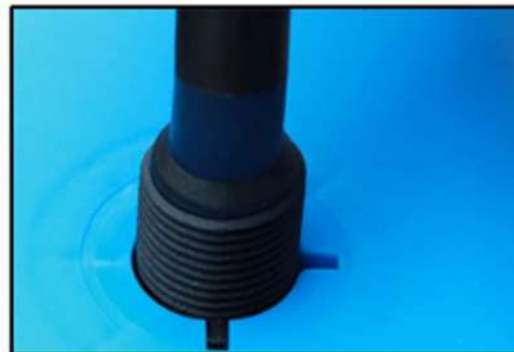
Step 2B : View from the top.