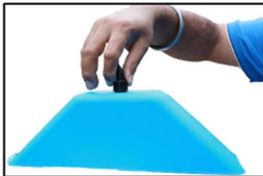
Step 5 : Tighten it all the way down