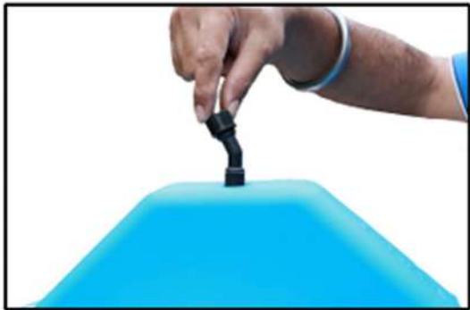
Step 4 : Place the nut and tighten.