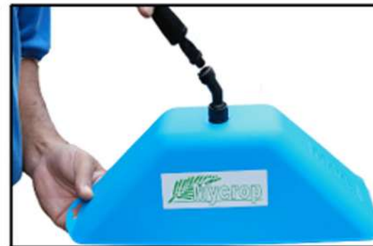
Step 6 : Insert the lance and tighten the nut.